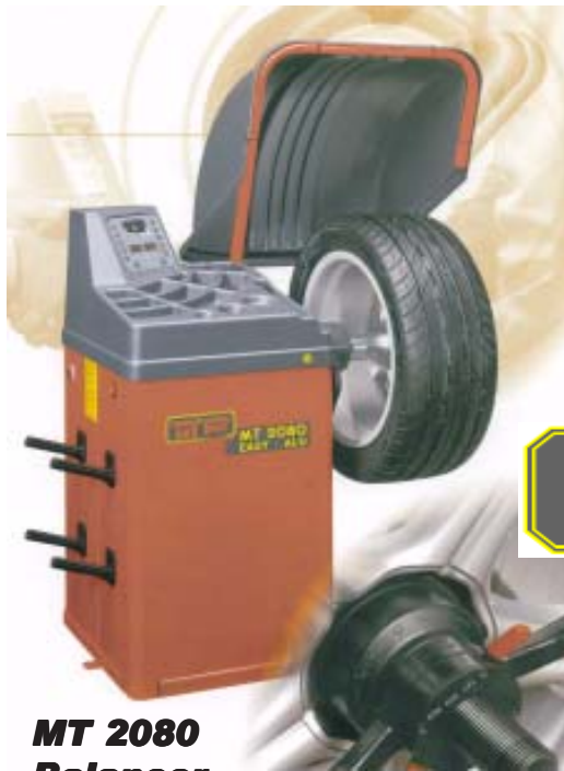
MT 2080 Balancer

We have successfully modified the mounting brackets to use this aligner on large trucks