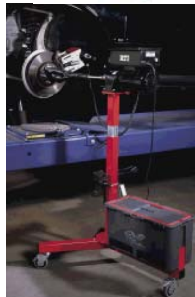
Canvik On-The-Car Lathe CBM-40