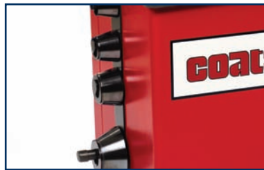
On Board Accessory Storage