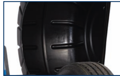
Auto Start Hood