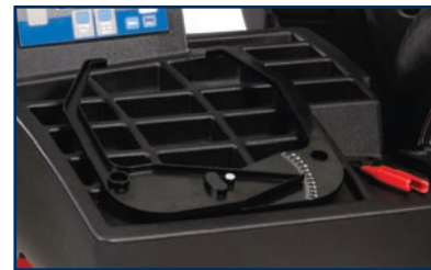
16-Pocket Weight Tray